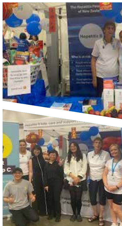
Chinese New Year Festival