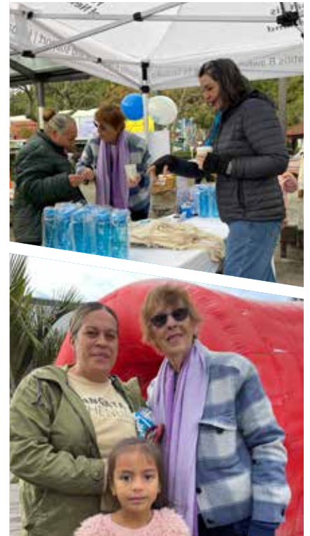
World Hep Day