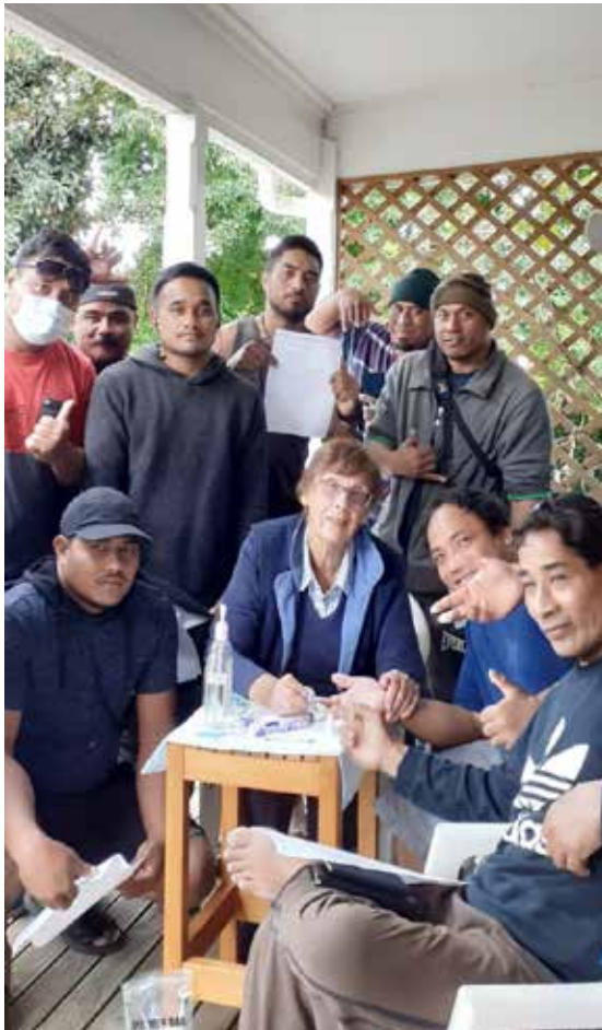
Kiwifruit Workers from Kirabus