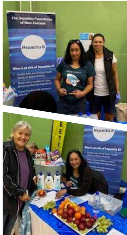
Have a Heart